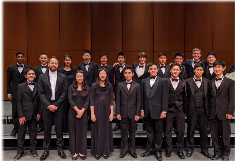
Saratoga HS Students participating in the 2020 Santa Clara County Honor Band!

Most students in Band participate in athletics, clubs, and many other activities, including Rhetoric and Drama. Students need not be enrolled in an actual Rhetoric class or Drama class to participate in the Speech and Debate Team, or Schools Plays and Musicals.