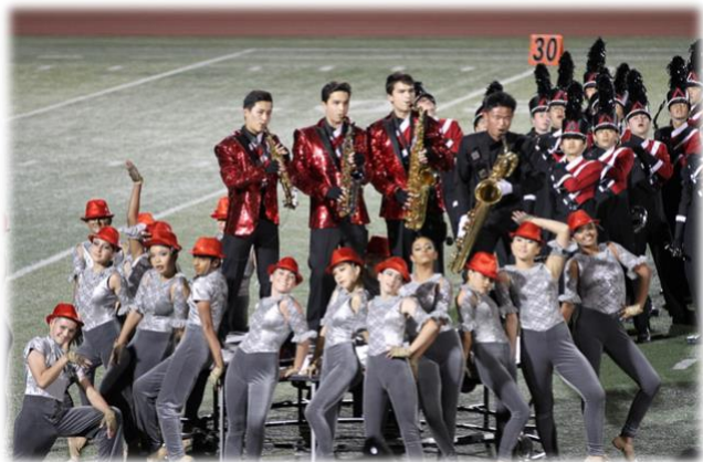
Featured Sax Quartet and Guard Members of the Saratoga High School 2019 Marching Band Production, Timeless

Does band look good on college applications? ABSOLUTELY! BAND STUDENTS CLEARLY STAND OUT! In fact, most college admissions departments seek out music students, as they recognize all that is involved in our academic discipline. Our graduates are attending some of the top universities and colleges in the country. Every year, the music office phone rings with questions from college admissions departments regarding our students. Most of our students stand out when compared to non-music students, and every year we have graduates earning scholarships based on their music participation and academic merit. No other organization on campus at SHS stands out in the way the Instrumental Music Program (Bands, Orchestras, Percussion, and Color Guard) does