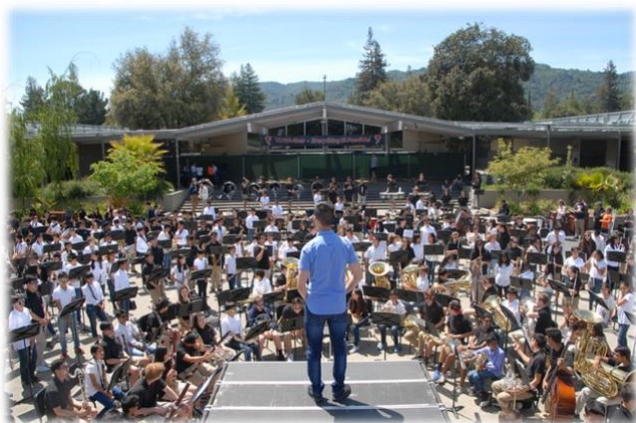
The combined MEGA Band from Redwood Middle School and Saratoga High School at the 2018 Pancake Breakfast!

Saratoga HS Music alums from the Class of 2020 are currently attending great colleges and universities all over the United States and Canada: