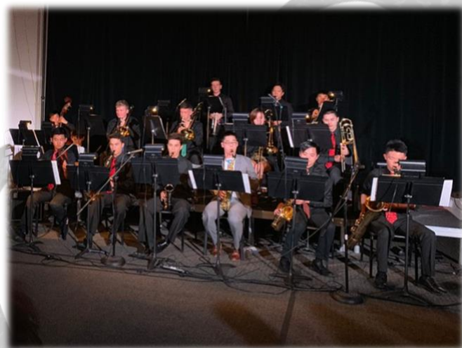
The Saratoga High School Advanced Jazz Band II at the Annual SMB Jazz Cabaret

SHS offers two jazz bands. For 2021-2022, Jazz Band I will meet during 8 th Period starting Spring Semester . No audition is required for Jazz Band I, and semester credit is given to students for the year of participation. Jazz Band II (Advanced Jazz Ensemble) explores the science behind sound engineering, recording, and production. Jazz Band II meets during 7 th Period is Performance-Based, and also satisfies the Applied Arts credit at SHS. Both Jazz Bands perform at the annual Jazz Cabaret, a night of music, swing dance, and food!