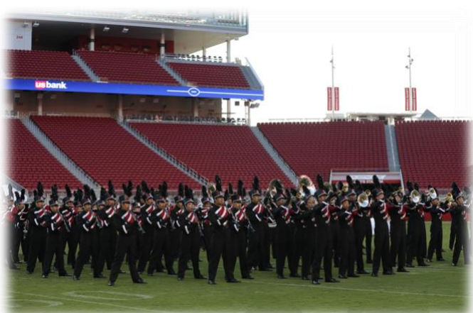
Saratoga Marching Band and Color Guard performing at Levi's Stadium during halftime for the 2018 Homecoming Game!